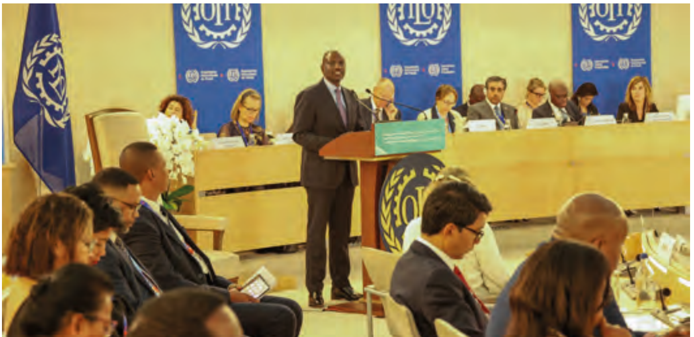
H.E the President delivers his remarks during the 111 th session of the International Labour Conference (ILC)

Kenya's delegation to the 111 th of ILC comprised of the following: