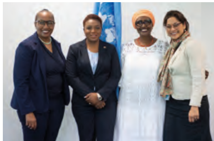
Ms. Susan Nakhumicha, Cabinet Secretary for Health with UNAIDS Executive Director and PEPFAR Deputy Global AIDS Coordinator