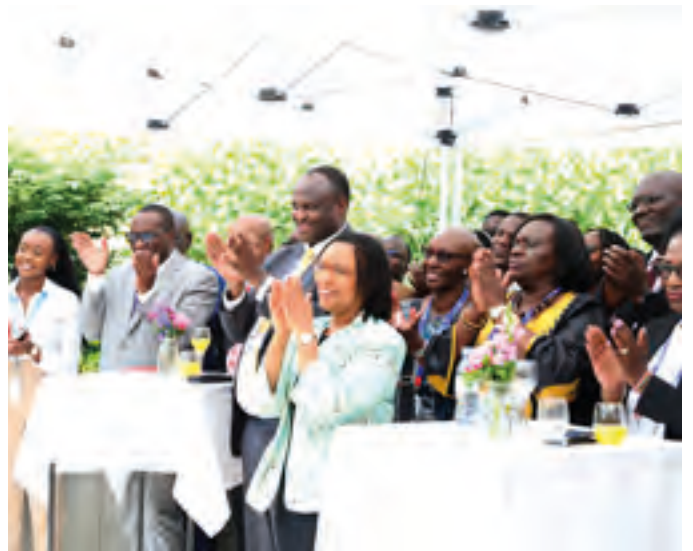
Delegates during H.Es visit to the Mission