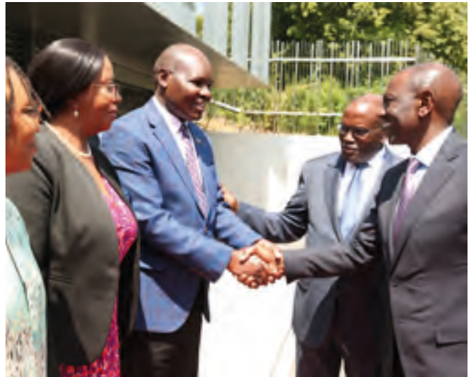
H.E the President meets the staff of the Kenya Mission