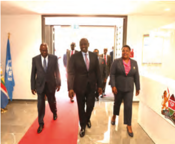
H.E the President arrives at the Kenya Mission, 15 th June, 2023