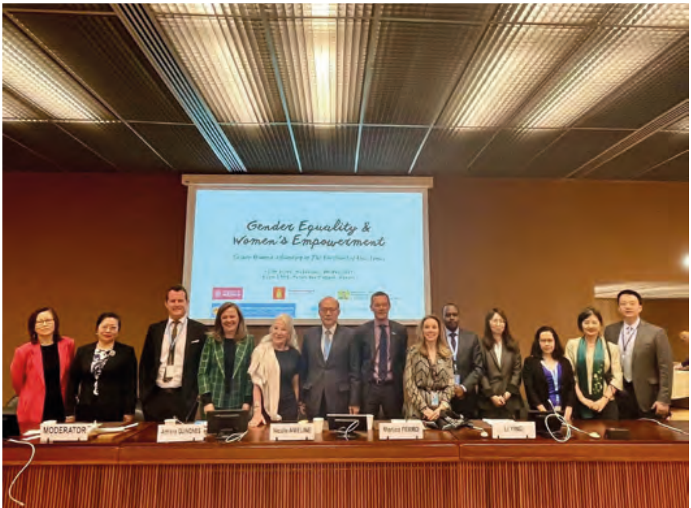
A group photo of the Co-organizers of the side event, the Permanent Missions of China, Denmark, Kenya and Mexico to the UN

Kenya continues to take various affirmative actions to give effect to the constitutional provision. These efforts have seen more women elected to and appointed in the Executive, Parliament and the Judiciary. In addition Kenya reiterated a National Strategy to enhance representation of women both in elective and appointive, in leadership positions through the “Kenya Kwanza Plan”.