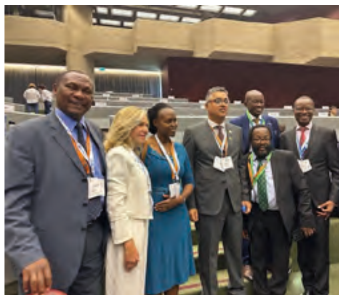
Kenya's delegation immediately after clinching the Executive Council seat

It is also worth noting that, the WMO Office for Eastern and Southern Africa is based in Nairobi, Kenya, and is the main contact point for the National Meteorological and Hydrological Services (NMHS) in the area that shares data and information and collaborates on developing early warning systems and adaptation strategies.