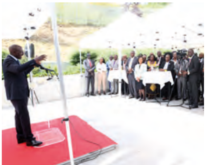
H.E the President addressing the Kenya delegation to the 111 th session of ILC at the Mission