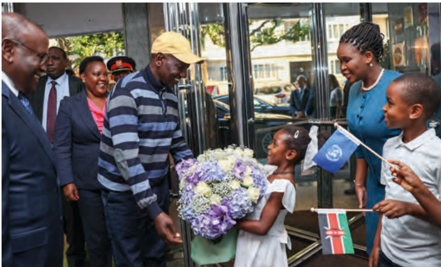
H.E the President is received at the Hotel President Wilson, in Geneva