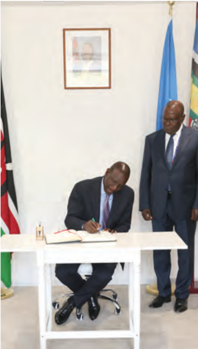
H.E. the President signing the visitors book at the Mission