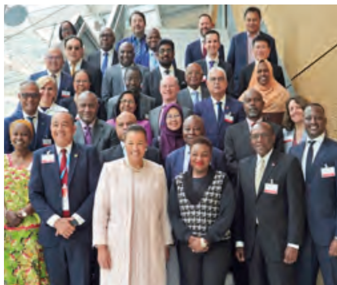
Commonwealth Health Ministers with the Secretary General of the Commonwealth

will contribute to a more equitable and healthier society, leaving no one behind.