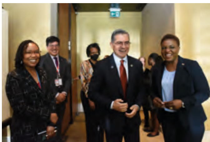
Ms. Susan Nakhumicha, Cabinet Secretary for Health with Xavier Becerra, US Secretary for Health and Human Services