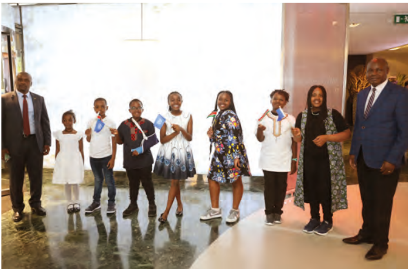
The children of the staff of the Kenya Mission await the arrival of H.E the President at President Wilson Hotel