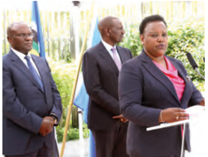
Cabinet Secretary for Labour and Social Protection, Ms. Florence Bore, addressing Kenya's delegation to the 111 th session of ILC at the Mission.