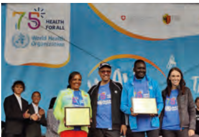
Ethiopian athlete Derartu Tul, WHO DG Dr. Tedros, Kenyan runner Paul Tergat and former Prime Minister of New Zealand, Jacinda Ardern