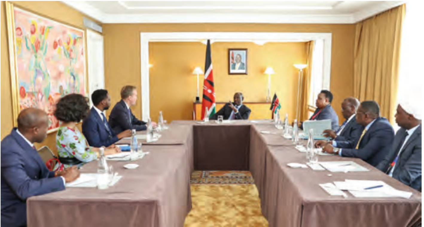
H. E the President during his meeting with the President of World Economic Forum, Mr. Borge Brende

H.E. Dr. William Ruto met with the President of the World Economic Forum, Mr. Borge Brende, on 16 June 2023 during his official visit to Geneva to address the World of Work Summit at the 111th Session of the International Labour Conference.