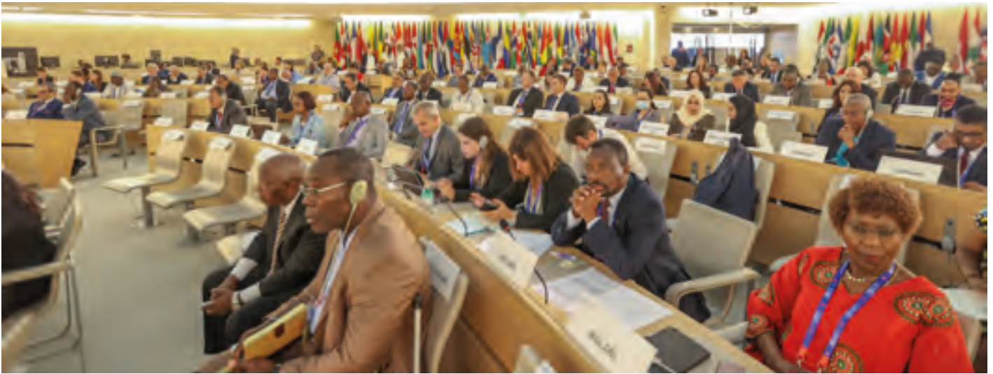
Delegates at the 111 th session of the International Labour Conference (ILC)

The Kenyan delegation fully participated in the discussions at all levels, Technical Committees, African Group, and plenary. At the regional level, Kenya was also assigned the role of observer at the African Group and participated in the drafting of the resolutions.