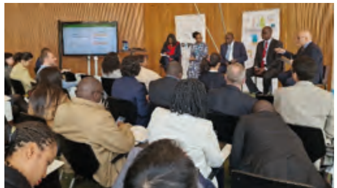
Participants during a Side-Event on Strengthening Africa's Voices in Global Digital Processes.

In the global South, the “Fourth Industrial Revolution” (4IR), is seen by many policy makers as an important opportunity for job and economic growth, and an alternative way to catch up to more advanced economies, amidst trends towards deindustrialization. The African Union, as well as a number of African governments, have placed heavy emphasis on the potential of the 4IR to create opportunities for young unemployed people across the region.